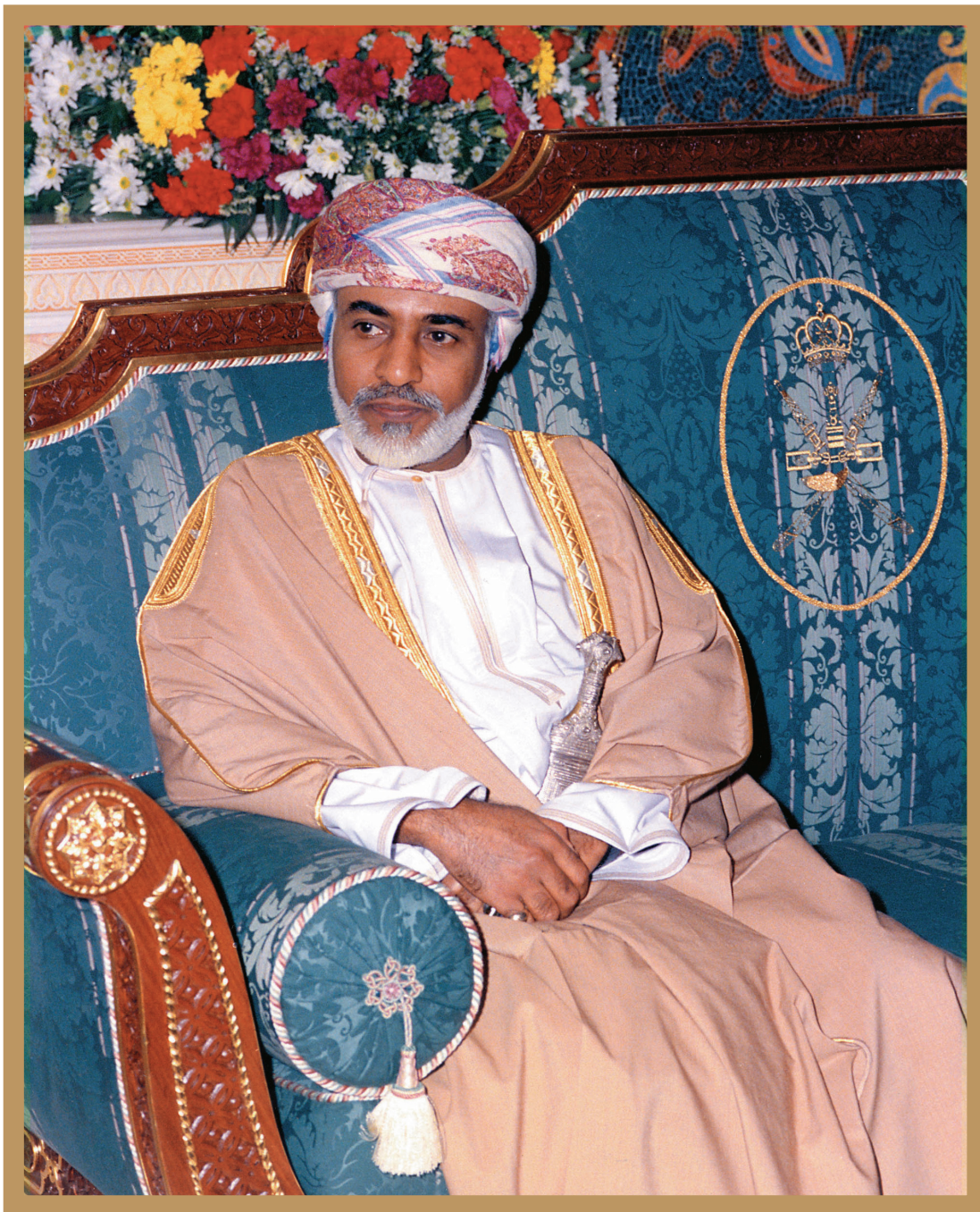
His Majesty Sultan Qaboos Bin Said